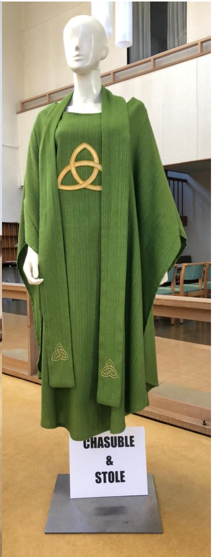
CHASUBLE & STOLE