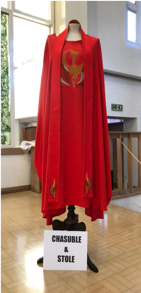
CHASUBLE & STOLE