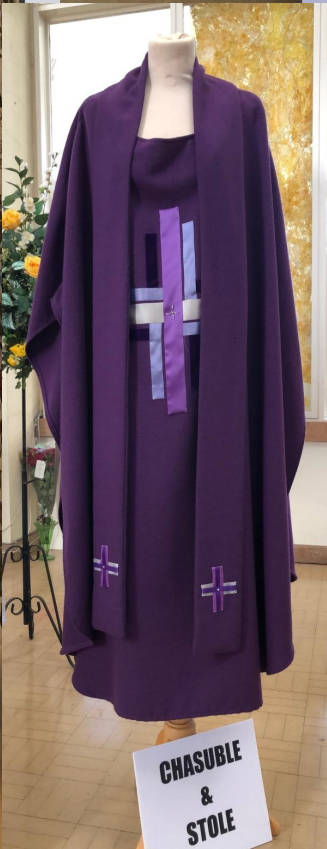
CHASUBLE & STOLE