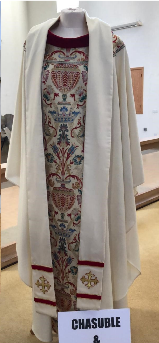
CHASUBLE & STOLE